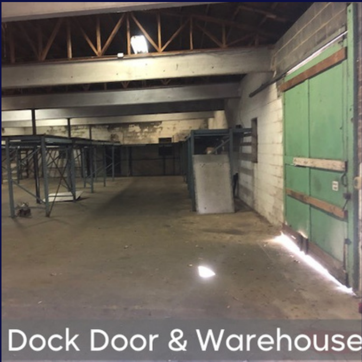
Dock Door & Warehouse