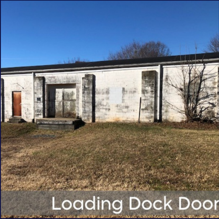
Loading Dock Door