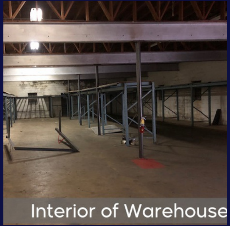
Interior of Warehouse