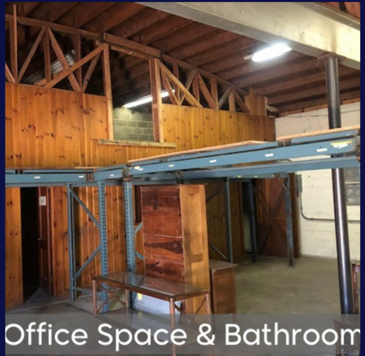
Office Space & Bathroom